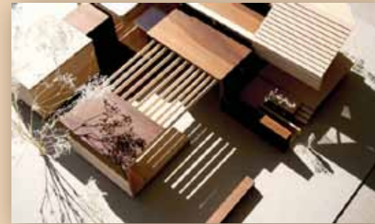
Student Team Design School of Architecture & Community Design, USF